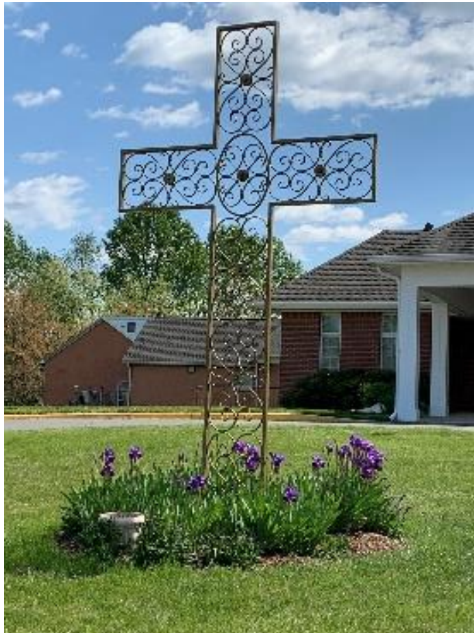
Springtime at DUMC!